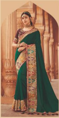
◀ 1901 ▶