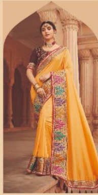
◀ 1903 ▶