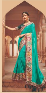
◀ 1907 ▶