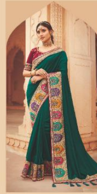
◀ 1909 ▶