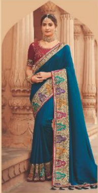
◀ 1901 ▶