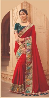
◀ 1902 ▶