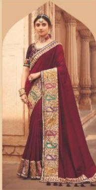
◀ 1903 ▶