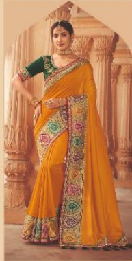
◀ 1906 ▶