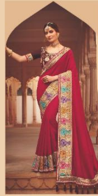
◀ 1908 ▶