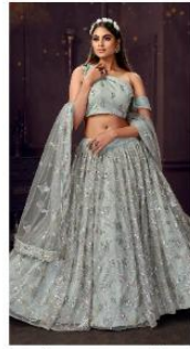
❁ D.No. 1050 ❁