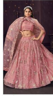
❁ D.No. 1048 ❁