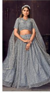
❁ D.No. 1047 ❁