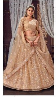
❁ D.No. 1049 ❁