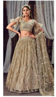
❁ D.No. 1052 ❁