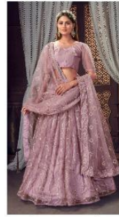
❁ D.No. 1051 ❁