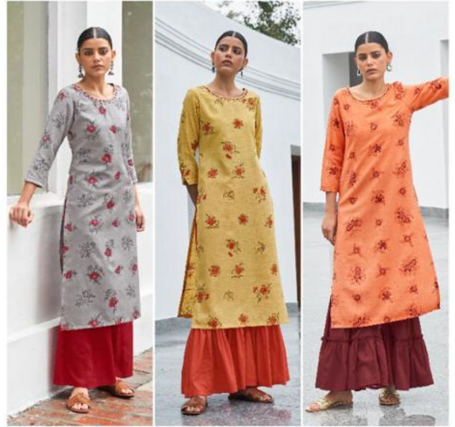
5 1 0 4