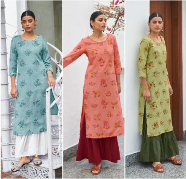
5 1 0 1