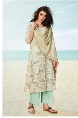
| 1853 |