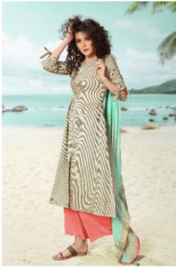
| 1854 |