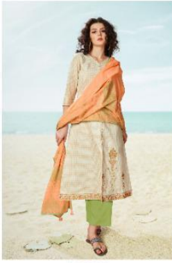
| 1851 |