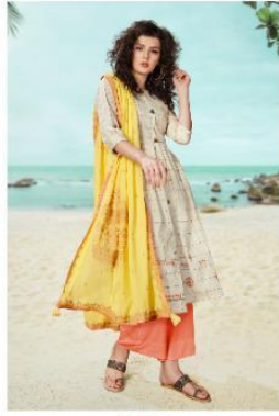
| 1852 |