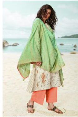
| 1856 |