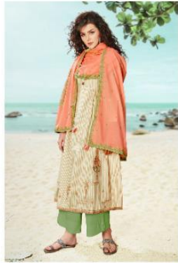
| 1855 |