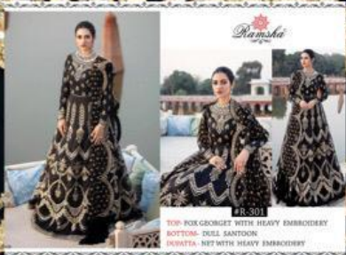
Ravnski #R-301 TOP: FOX GEORGET WITH HEAVY EMBROIDERY BOTTOM: BELL SARTON DUPATTA: NET WITH HEAVY EMBROIDERY