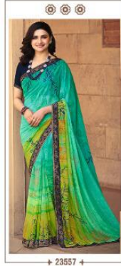
+ 23557 +