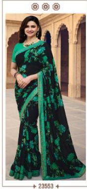
+ 23553 +