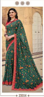
+ 23554 +