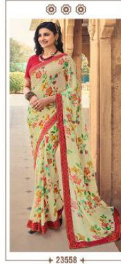
+ 23558 +