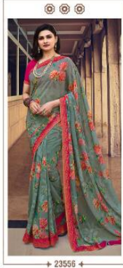
+ 23556 +