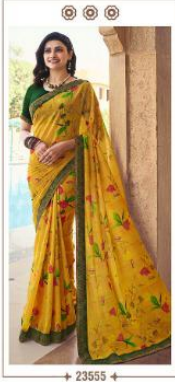
+ 23555 +