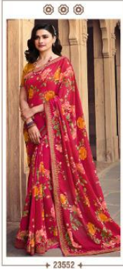
+ 23552 +