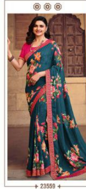
+ 23559 +