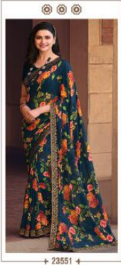
+ 23551 +