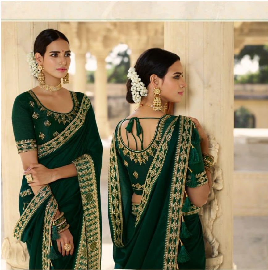
WEAR IT IN YOUR STYLE 1607