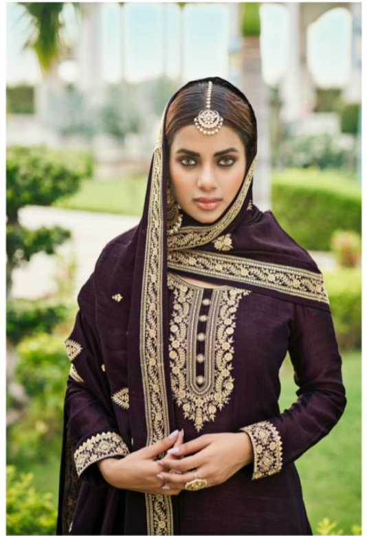
The new age style calls for a change in trend. Ditch heavy embroidery for delicate embellishments on the lighter-than-air dress.