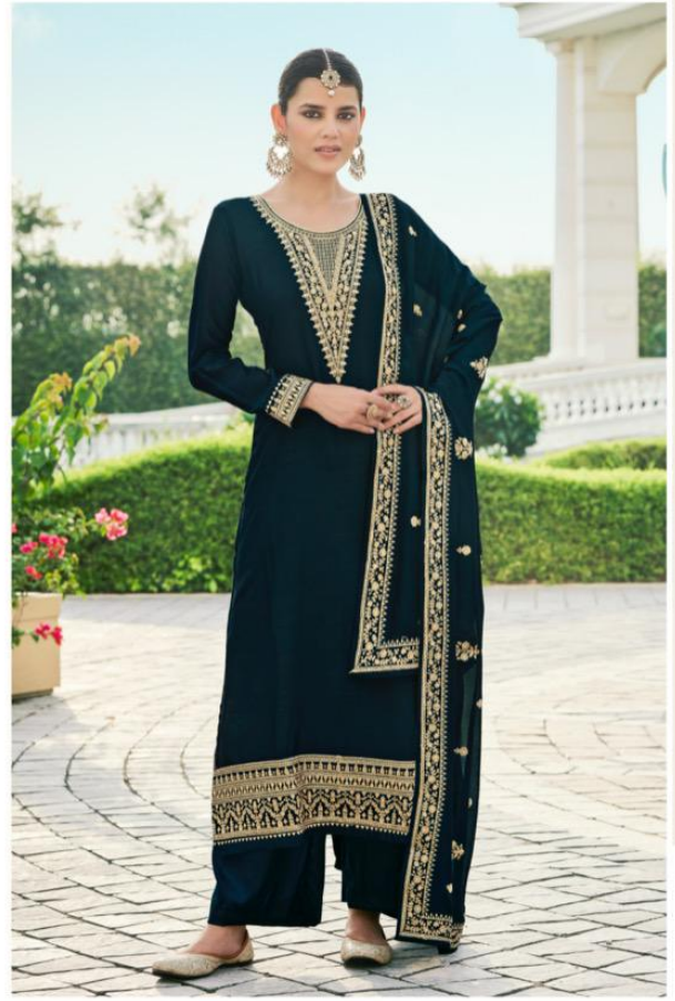
It is you, the head turner keeping everything classy and graceful! ~106~