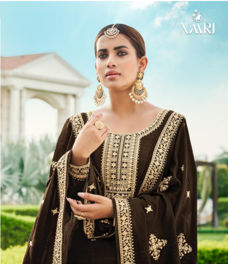
Sophisticated & confident, this pastel embroidered dress instills a little more oomph into your smart wardrobe.