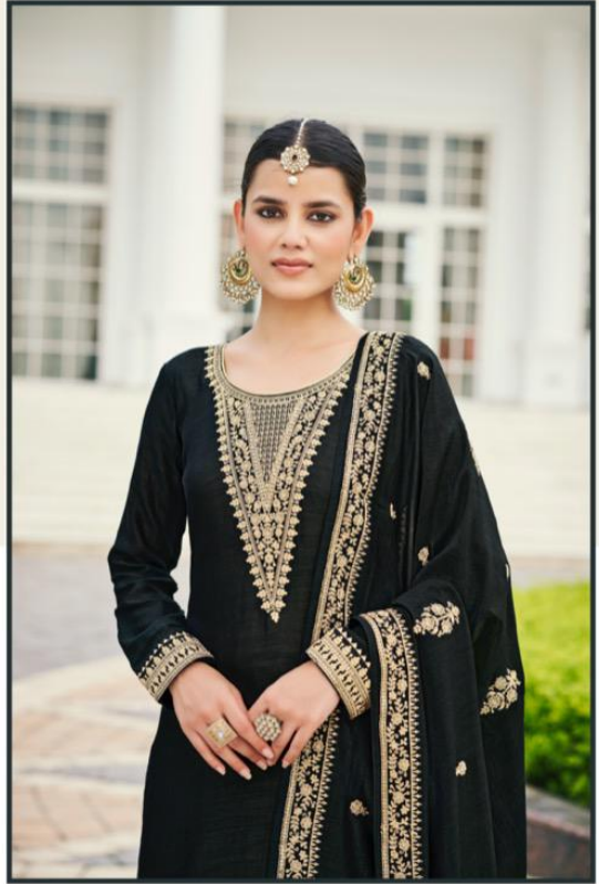
Evocative of a confident elegance without being overly feminine, this stylish outfit is instant classic.