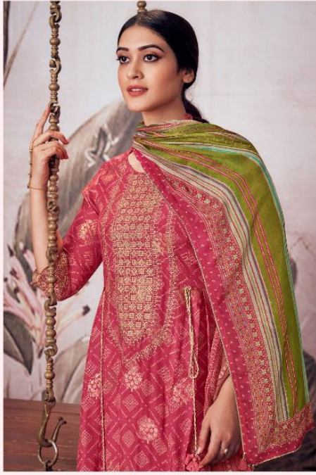
By the pattern & vibrant color of saree get beautiful contrast