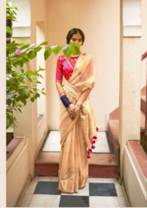
D. No. 2015

A SENSE OF VERSATILITY AND AN EPILOGUE OF SERENITY