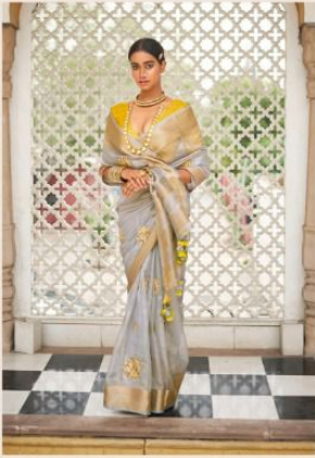
D. No. 2011