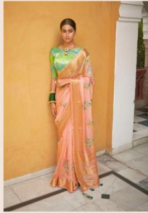
D. No. 2012