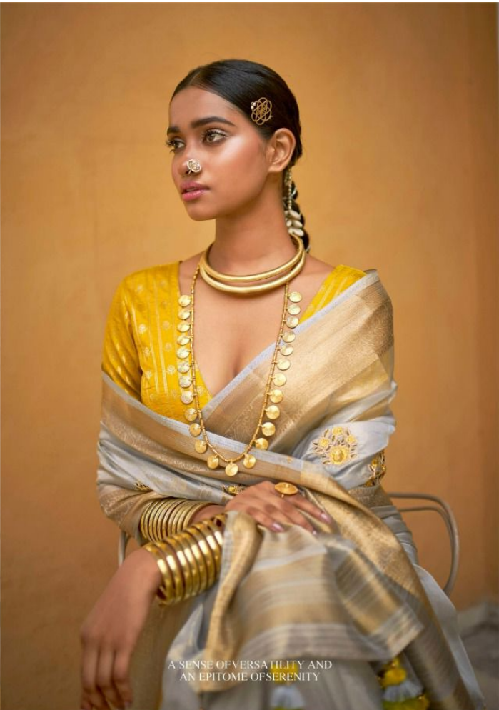
A SENSE OF VERSATILITY AND AN EPITOME OF SERENITY