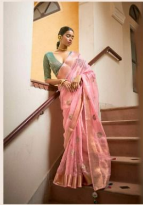
D. No. 2014