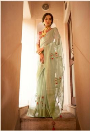
D. No. 2013