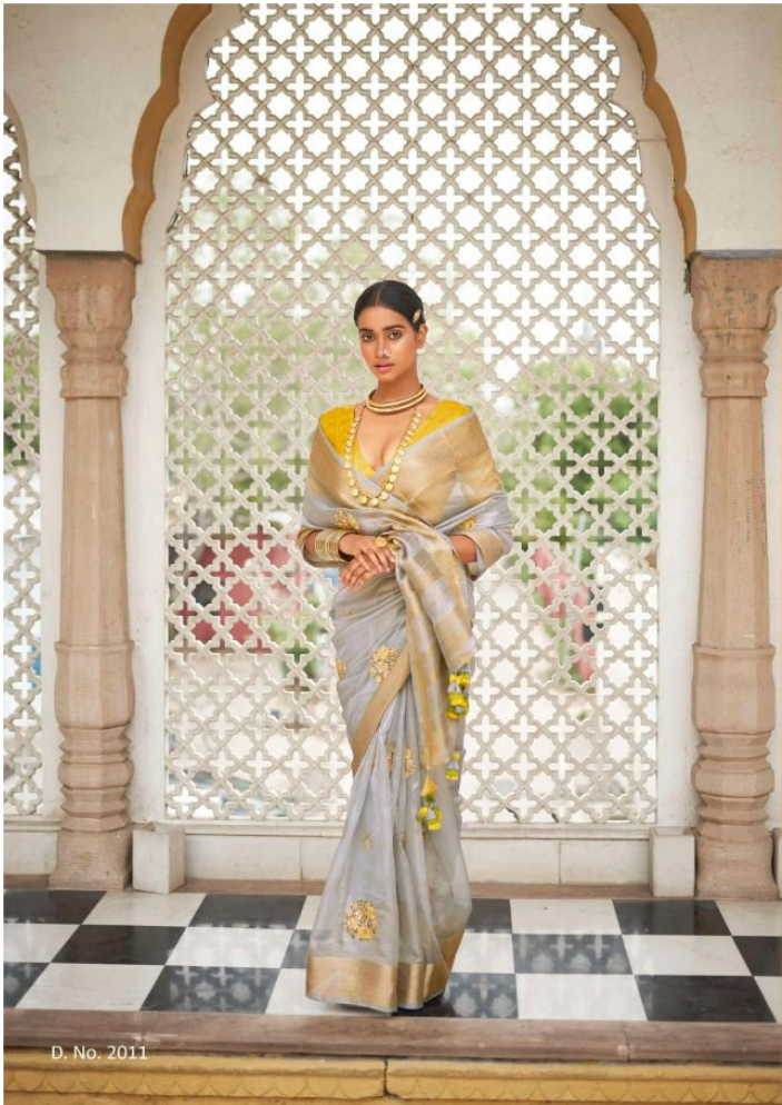
D. No. 2011