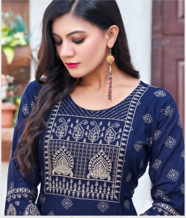
Traditional looks rule the season with a hint of modern-chic!