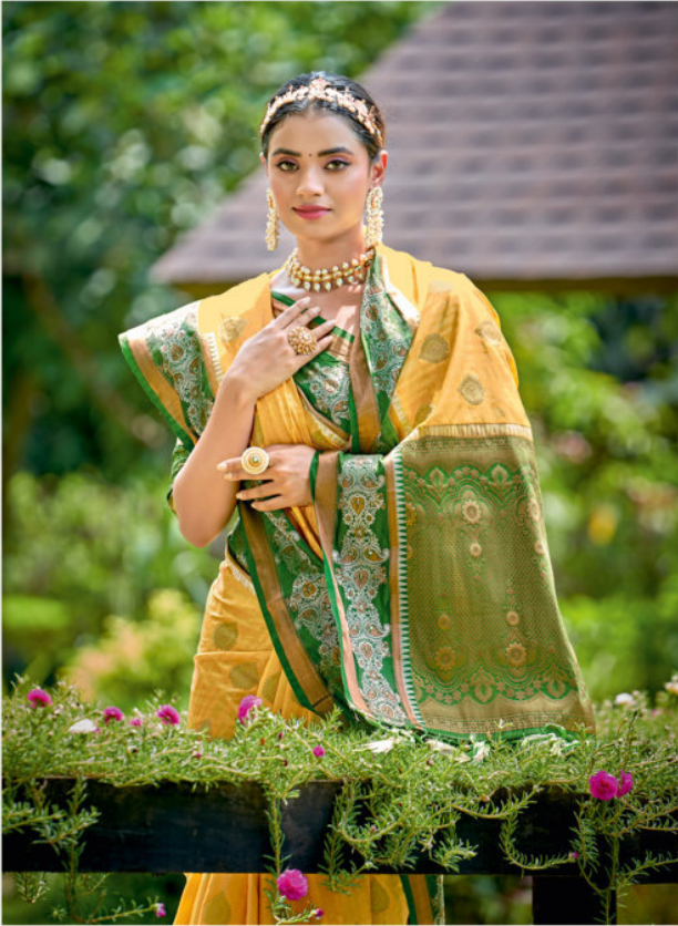
Feed the fashion fever and ignite the spark of elegance within you.