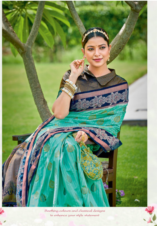
Soothing colours and classical designs to enhance your style statement