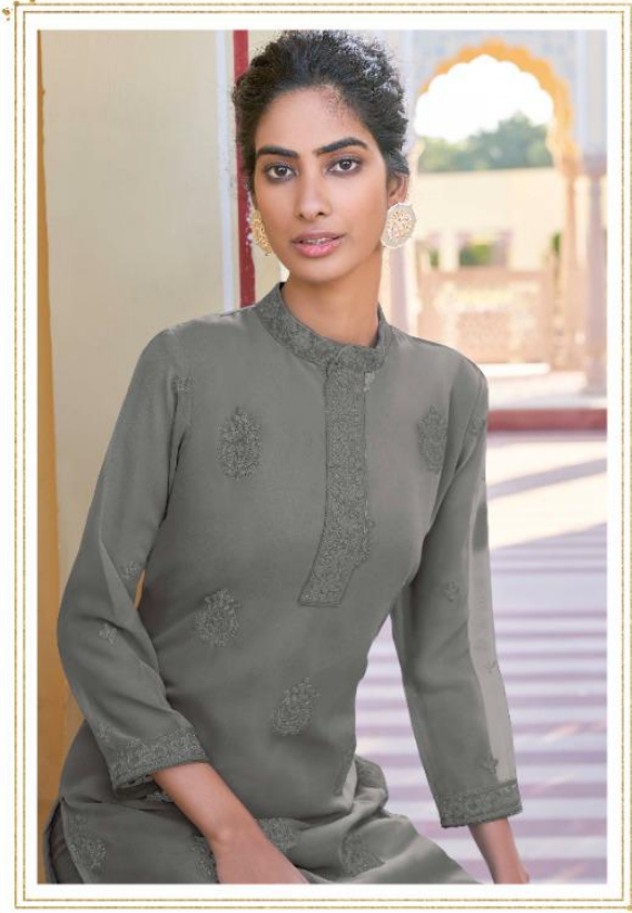
C-L-A-S-S-Y Embroidered kurta in 100% cotton & organza fabric. 19026