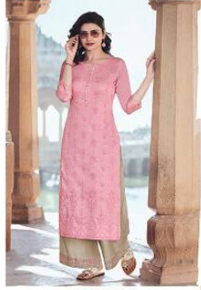
| 38407 |