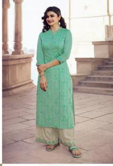
| 38403 |