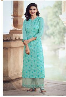
| 38406 |