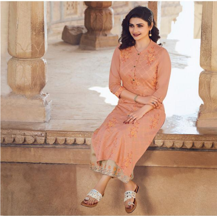
| 38407 |