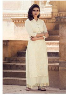
| 38406 |