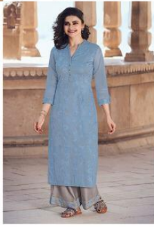
| 38401 |