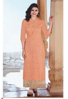
| 38408 |