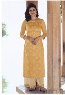
| 38402 |