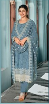
◆ 16712 ◆