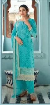
◆ 16718 ◆