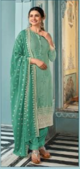
◆ 16715 ◆