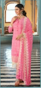
◆ 16711 ◆