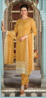
◆ 16717 ◆