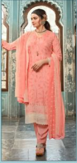
◆ 16716 ◆