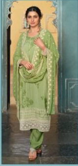
◆ 16713 ◆