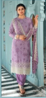
◆ 16714 ◆