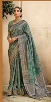
D. NO.- 2211