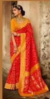
D. NO.- 2210