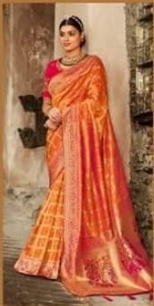
D. NO.- 2206