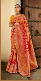
D. NO.- 2201