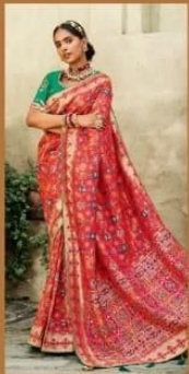
D. NO.- 2204