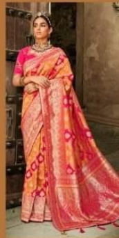
D. NO.- 2212