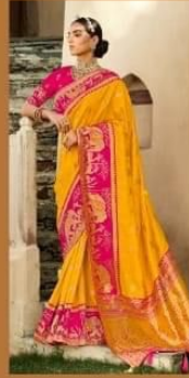
D. NO.- 2209