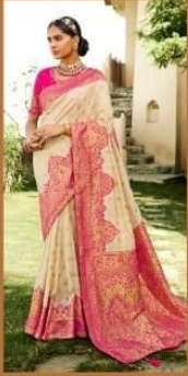
D. NO.- 2203