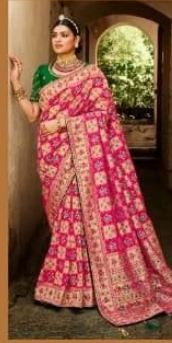
D. NO.- 2207