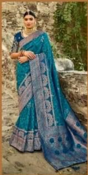
D. NO.- 2205