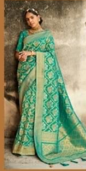
D. NO.- 2208