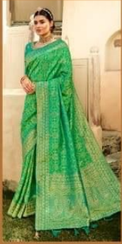
D. NO.- 2202