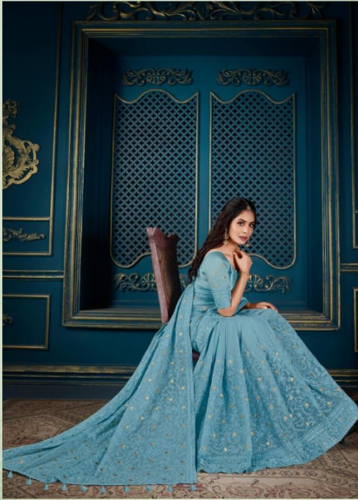
05 We're feeling beauty this winter with amazing design and pleasing colours promise to get us in the mood, in a single bound