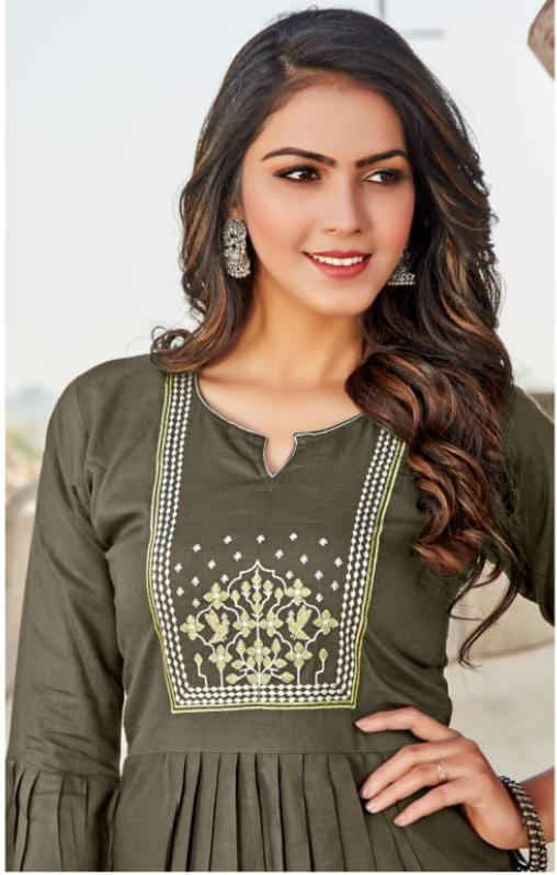
CREAM OF THE CROP