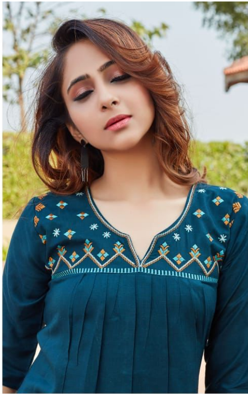
CREAM OF THE CROP