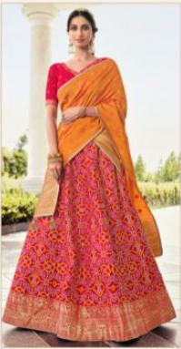
◆ 4276 ◆