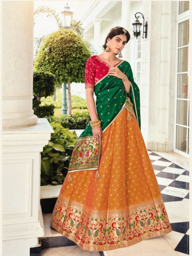
●●● Mustard banarsi lehenga with tassels paired with bottle green colour banarsi dupatta with tassels, having rani banarsi blouse