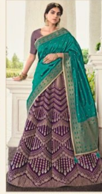
◆ 4274 ◆