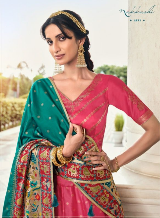
ಗಜ್ಜಾರಿ ಹನಾರಿ ಲೆಂಗಾ ಪೇರಿಡ್ ತಾವಲೆ ಪೇರಿಡ್ ರಾಮಾ ಕಲೂರ ಹನಾರಿ ಥಿಪ್ಪಾ ಪೇರಿಡ್ ತಾವಲೆ, ಹಾವಿಂಗ್ ಗಜ್ಜಾರಿ ಹನಾರಿ ಬ್ಲೂಸ್