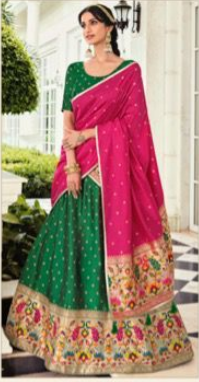
◆ 4270 ◆