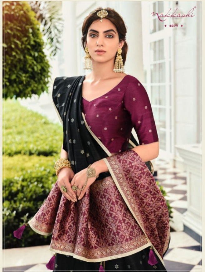
Black • • • Black banarsi lehenga with tassels paired with black colour banarsi shoppata with tassels having wine banarsi blouse