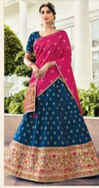
◆ 4273 ◆