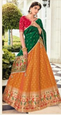
◆ 4272 ◆