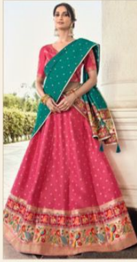
◆ 4271 ◆