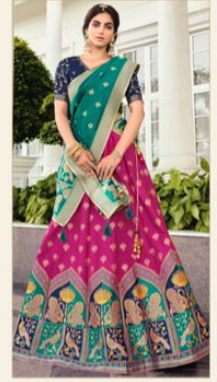
◆ 4275 ◆