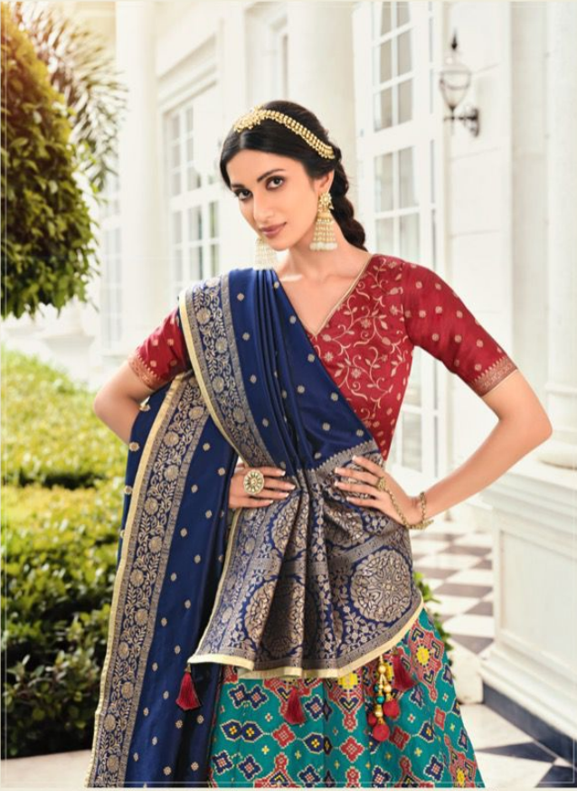
19953 • • • Rama banarasi Lehenga with tassels paired with navy blue colour banarasi dupatta with tassels, having maroon banarasi blouse