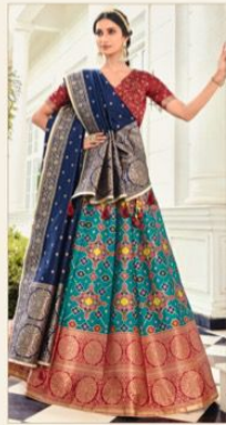
◆ 4278 ◆