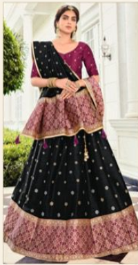
◆ 4277 ◆