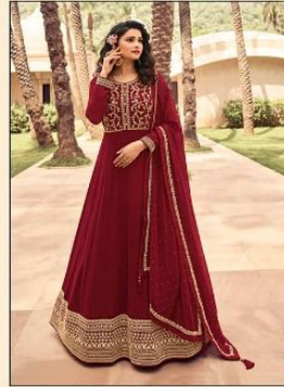
• 14827 •