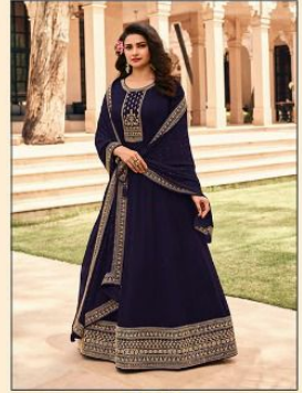
• 14826 •