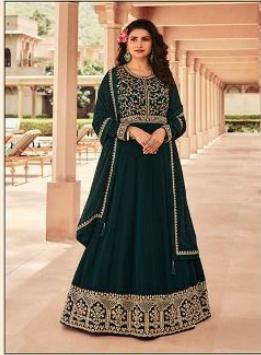
• 14823 •