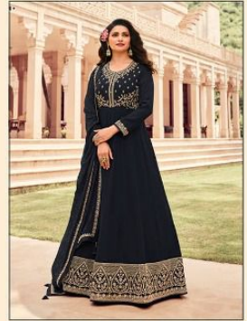
• 14828 •