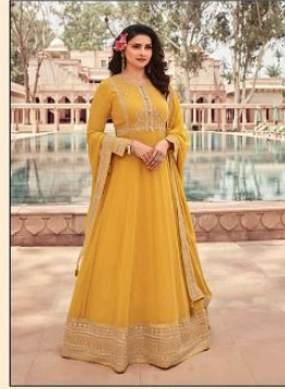
• 14825 •