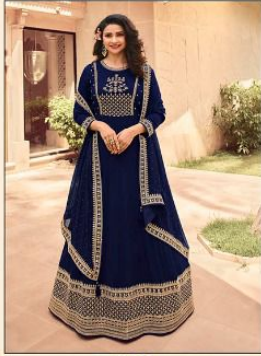
• 14821 •