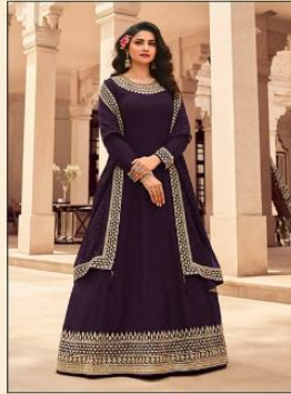
• 14824 •