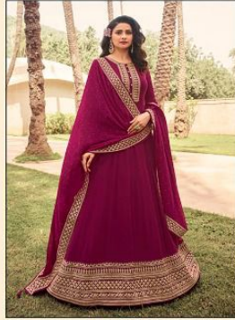
• 14822 •