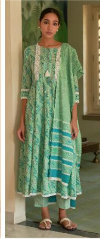
K - 205