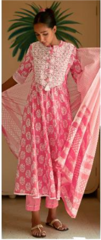
K - 202