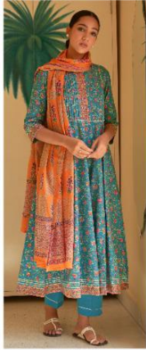
K - 203