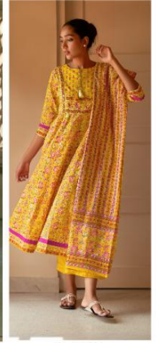
K - 206