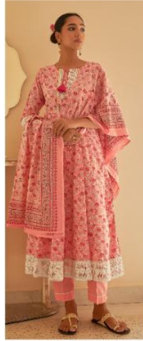
K - 204