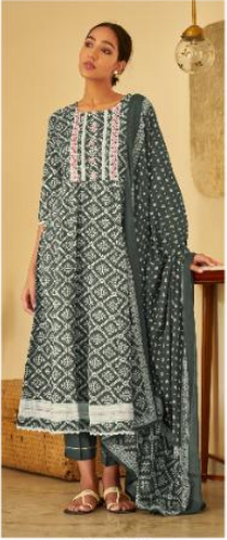
K - 201